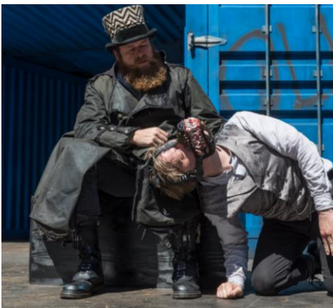
Bill Sikes with Bullseye

Meanwhile, Miss Monks goes to meet with Mr Bumble and Mrs Corney at the workhouse, and gives them money so that they keep what they know of Oliver's background a secret. She also takes from Mrs Corney the only piece of evidence that proves who Oliver is...a locket.