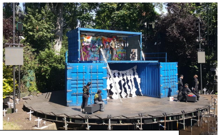
This is how the set looks when it revolves and opens to reveal scenes.