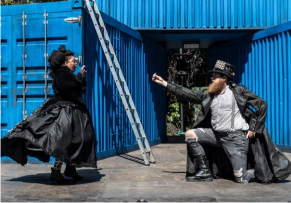
Mr Bumble asks Mrs Corney to marry him.

We then return to Fagin's den. Fagin's gang make a lot of noise as Oliver is returned to them. Bill Sikes is angry with Oliver, thinking that he may have told Mr Brownlow about them. When Bill tries to grab him, Nancy steps in to protect Oliver - which Bill doesn't like.