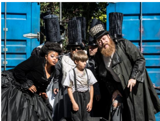
Mrs Corney and Mr Bumble with Oliver

The play opens in a Workhouse and we see the inmates working very hard to earn their next meal; the music builds as they do their work, and we hear a dog barking too. We also see smoke. We see a small boy join the workers, only to have a box placed over him! We hear Mr Bumble, Mrs Corney and – standing around the auditorium – the Governors of the Workhouse (those who are in charge) talking about a boy who had dared to ask for more food. That boy is Oliver Twist . We hear how Oliver's mother, Agnes , died when she gave birth to him and, as the Workhouse authorities didn't know of any other family member, why he remained in the Workhouse. They are deciding what to do with the boy.