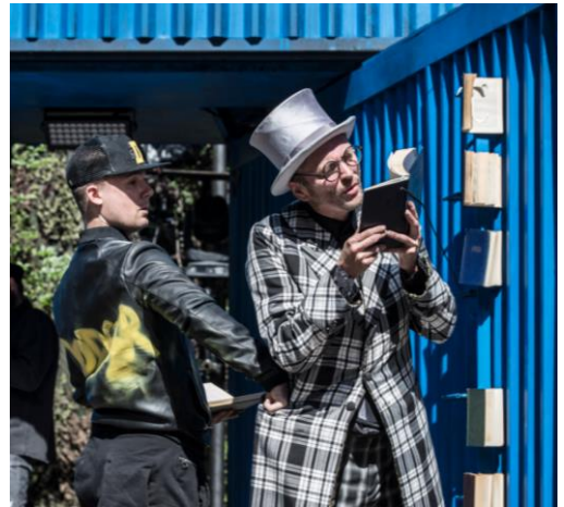
Jack pickpocketing Mr Brownlow

Oliver is taken to court and accused of robbery by the judge, Mr Fang , but the bookseller arrives just in time to report that it was other boys, not Oliver, who stole Mr Brownlow's wallet. Oliver starts to feel unwell so, to make amends for wrongly accusing him, Mr Brownlow offers him his home as a safe place to stay and recover. A friend of Mr Brownlow, Mr Grimwig , is suspicious about Oliver, but Mr Brownlow pays no attention.