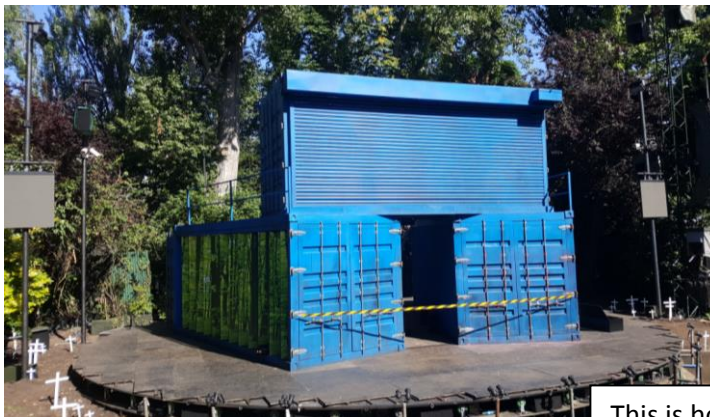
This is how the set will look when you arrive

Around the stage you will see gravestones reminding us that a lot of poor people died in those days. You will also see three large shipping containers, two on the ground and one lying across the top of them. The sides of these containers open and close to reveal scenes inside them.