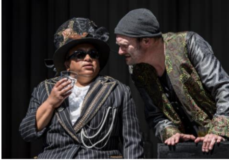
Miss Monks with Fagin

Just then, a mysterious woman, Miss Monks (who has been looking for Oliver) arrives. We discover the reason for her search: Oliver is Miss Monks' half-brother (they have the same father). We learn that their rich father had left her and her mother when she was a child, to run away with Agnes, Oliver's mother. Now their father is dead, it means that his inheritance would be shared between Miss Monks and Oliver – that is, if Oliver ever found out who he really was; Miss Monks wants to ensure that he never finds this out, and she pays Fagin to keep him in his gang and out of the way.