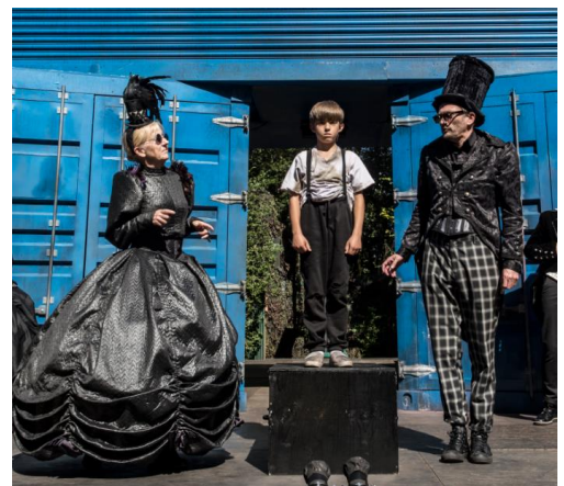
Mr and Mrs Sowerberry buy Oliver

Nancy arrives at Fagin's 'den'. Although now an adult she used to work for Fagin when she was a child. Together Fagin, Nancy, Dodger and Charley teach Oliver how to pick pockets - but they make it into a game ( including a dance ), so that Oliver doesn't realise that what they're doing is wrong. However, as Oliver goes to bed, his mother appears to him in a dream, to warn him about his new 'friends'.